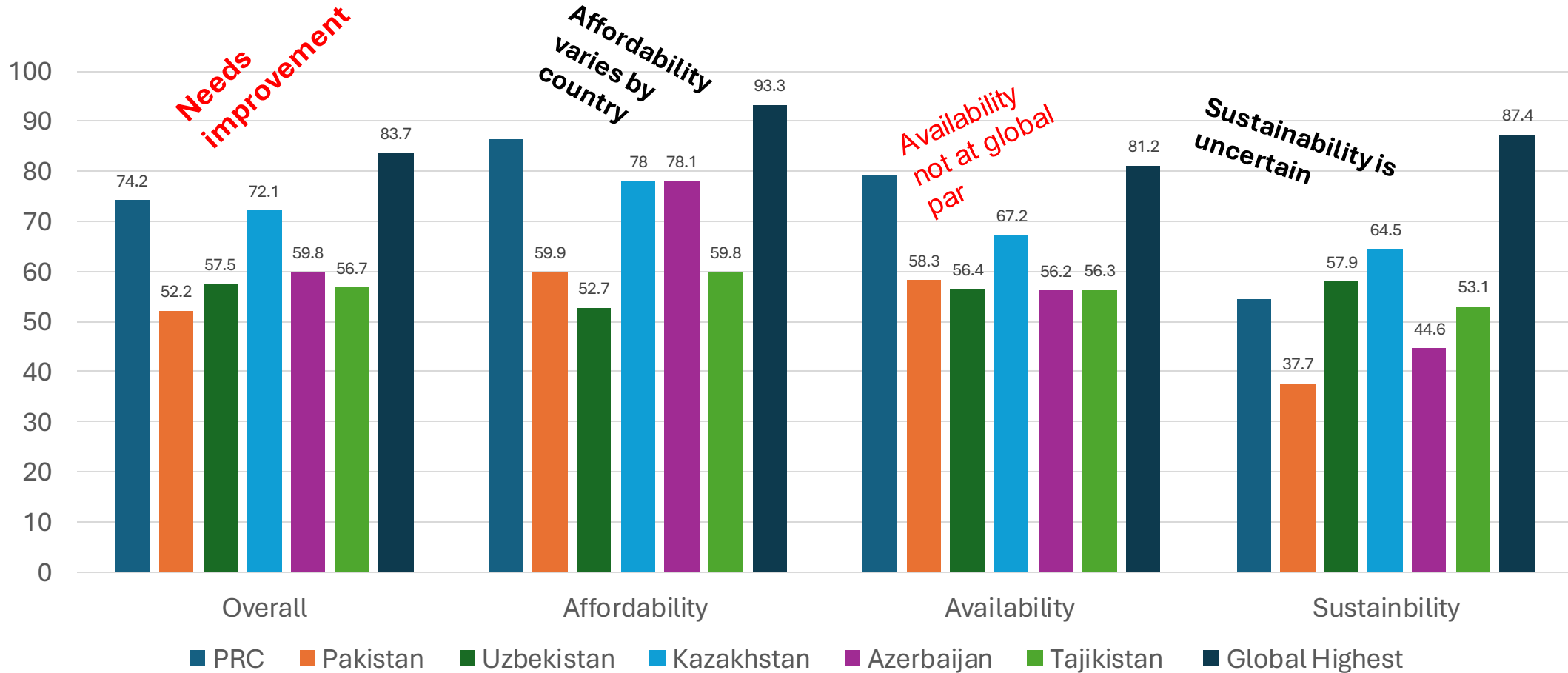
Source: Global Food Security Index 2022, The Economist.