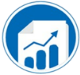
Economic and Financial Stability