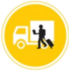
Trade, Tourism and Economic Corridors