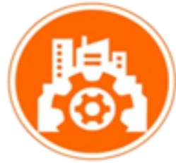
Infrastructure and Economic Connectivity