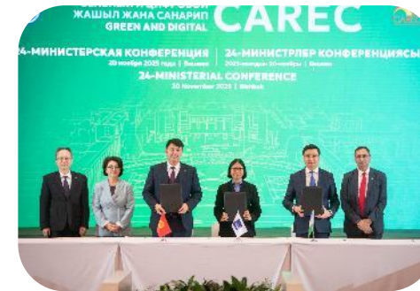
MOU on the Kyrgyz Republic–Uzbekistan Cross-Border Sustainable Tourism Cluster Development