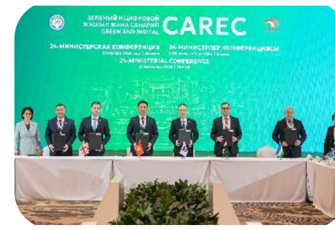
MOU on Implementing the Testing Phase of the Expanded CAREC Advanced Transit System and Information Common Exchange