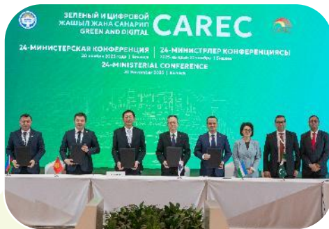
MOU on Pilot Project on Electronic Exchange and Mutual Recognition of Conformity Certificates