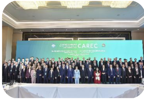
Bishkek Ministerial Declaration on the Launch of Negotiations for the CARTIF Partnership Agreement