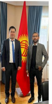
With Member of Ministry of Economy & Commerce