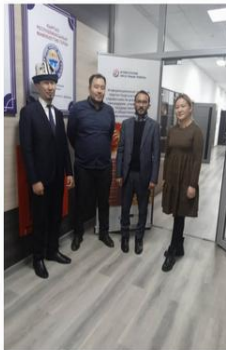
With Team of Single window customs Kyrgyzstan