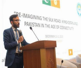
Speech to Participants in Bishkek December 2020