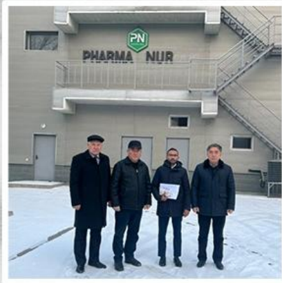
MEETING WITH PHARMA NUR MANAGEMENT