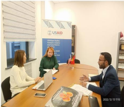
With US AID - Kyrgyzstan Team