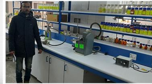
"LABORATORY VISIT OF AIDAN PHARMA"