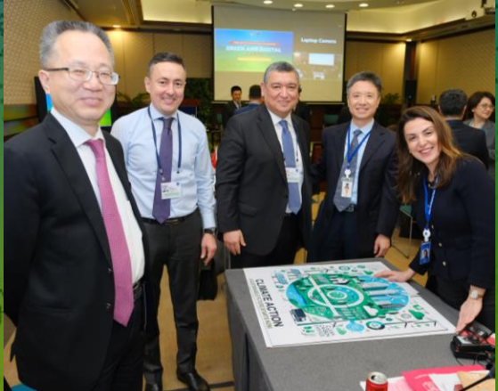
Team building activity