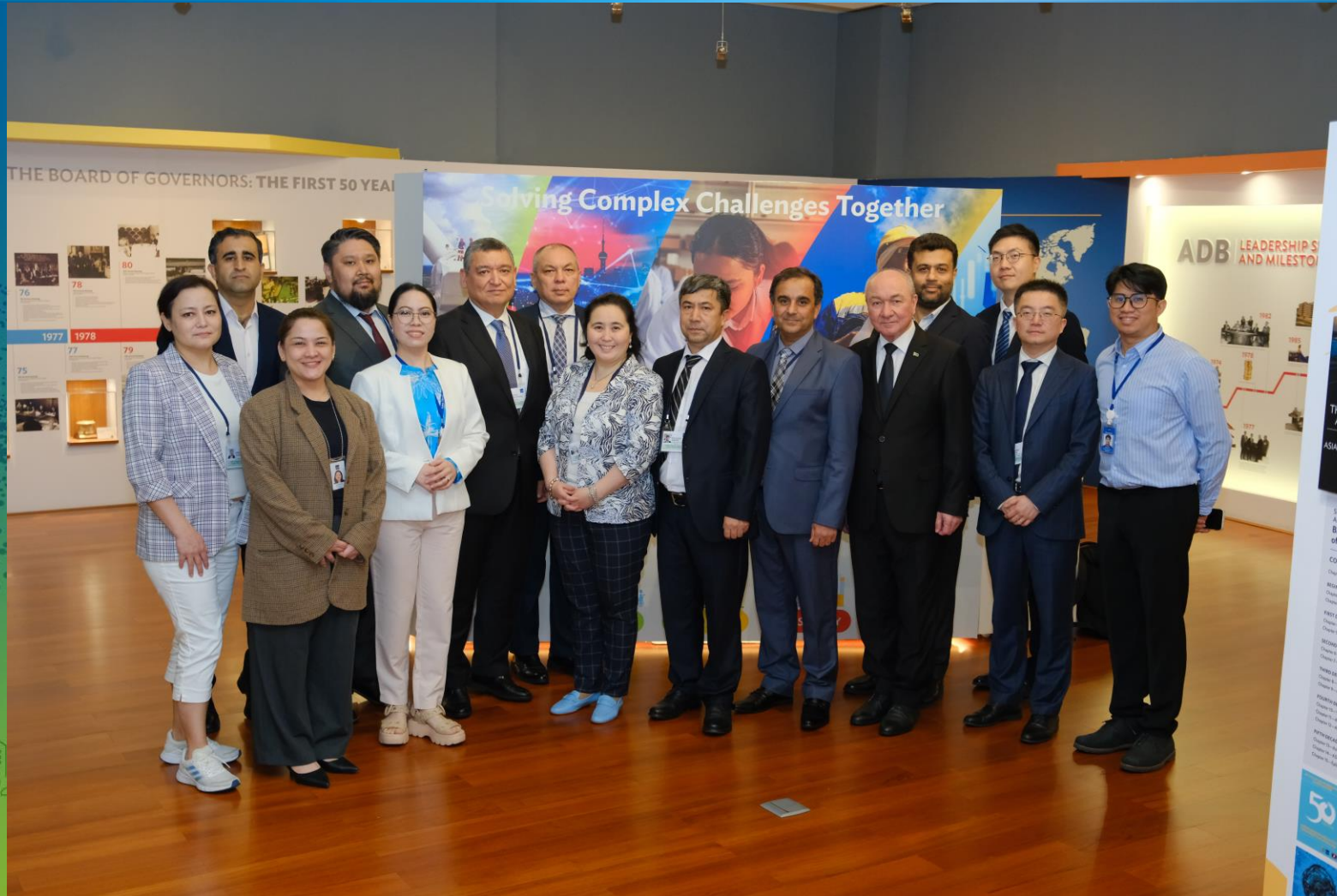
CAREC NFP Strategic Planning Meeting participants pose for the group photo at the ADB Gallery after the tour.

5-7 March 2025, ADB Headquarters, Manila